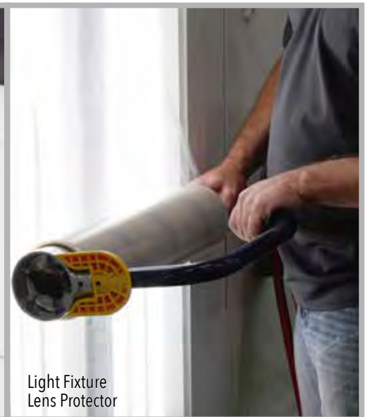
Light Fixture Lens Protector